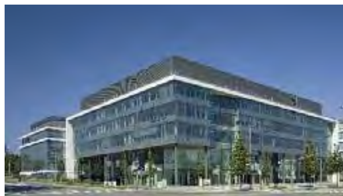
Allen & Overy in Luxembourg