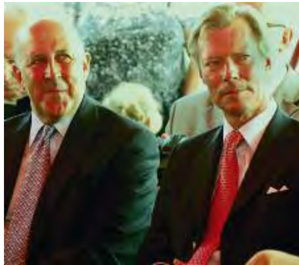
From left: Governor Jim Doyle and Grand Duke Henri of Luxembourg