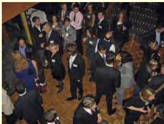
Members enjoying networking.

LACC would like to thank its members and Funaro & Co. CPA for its generous sponsorship of this event.