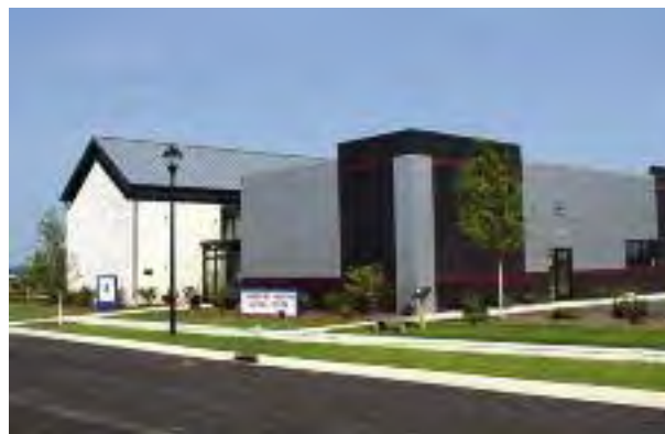
View of the New Center

Public tours for LACS members and guest followed on Saturday afternoon as well as on Sunday, August 9 as part of the annual Luxembourg Heritage Weekend in Belgium, Wisconsin.