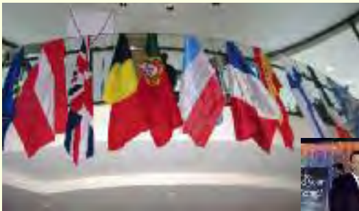
Thirteen European countries participating

O n Wednesday, May 20, over 500 people gathered at midtown Manhattan’s chic Brasserie 8 1/2 for the annual European-American Chamber of Commerce in the United States, Inc. Spring Networking event.