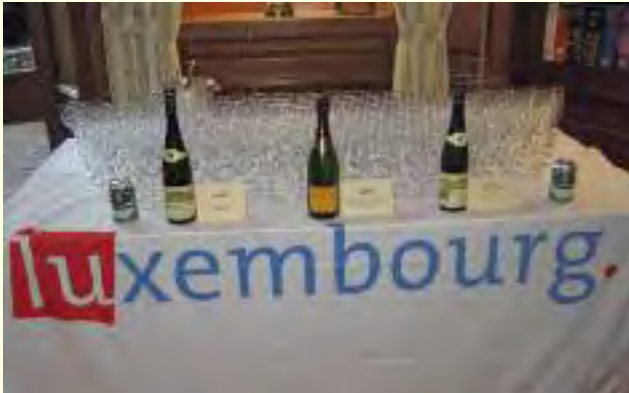
Display of Luxembourg wines and beer

The LACC would like to thank HSBC bank and the generous sponsors of this memorable evening.